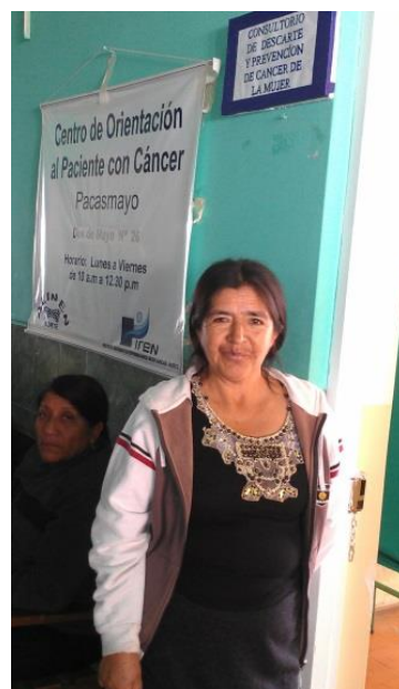
A woman waits for a breast exam in La Libertad, Peru

In 2011, we initiated a collaborative pilot demonstration of a model of care to improve access to and quality of breast cancer screening, diagnosis, and referral services. Notable results from this project include: