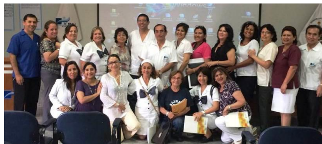
The Community Action Board brings together expertise from all parts of the cancer care system in La Libertad, Peru.

In July 2016 PATH received significant funding to scale-up this successful model for breast cancer screening in nine health networks in Trujillo, La Libertad. The new project aims to train 30 health promoters in breast health education and patient navigation, 300 midwives in clinical breast exam (CBE), and 12 hospital doctors in CBE, breast ultrasound, and FNA sampling.