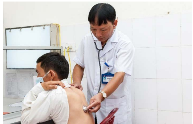
The mHealth system encourages TB patients to attend appointments on time.

This system aimed to both help patients to self-manage and enable health care workers to more efficiently and effectively monitor their progress.