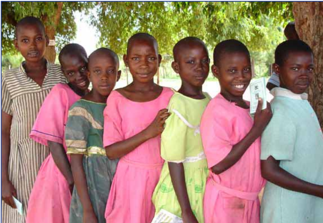
Primary school girls wait to receive HPV vaccinations, as part of a demonstration project implemented by the government of Uganda with technical support from PATH.