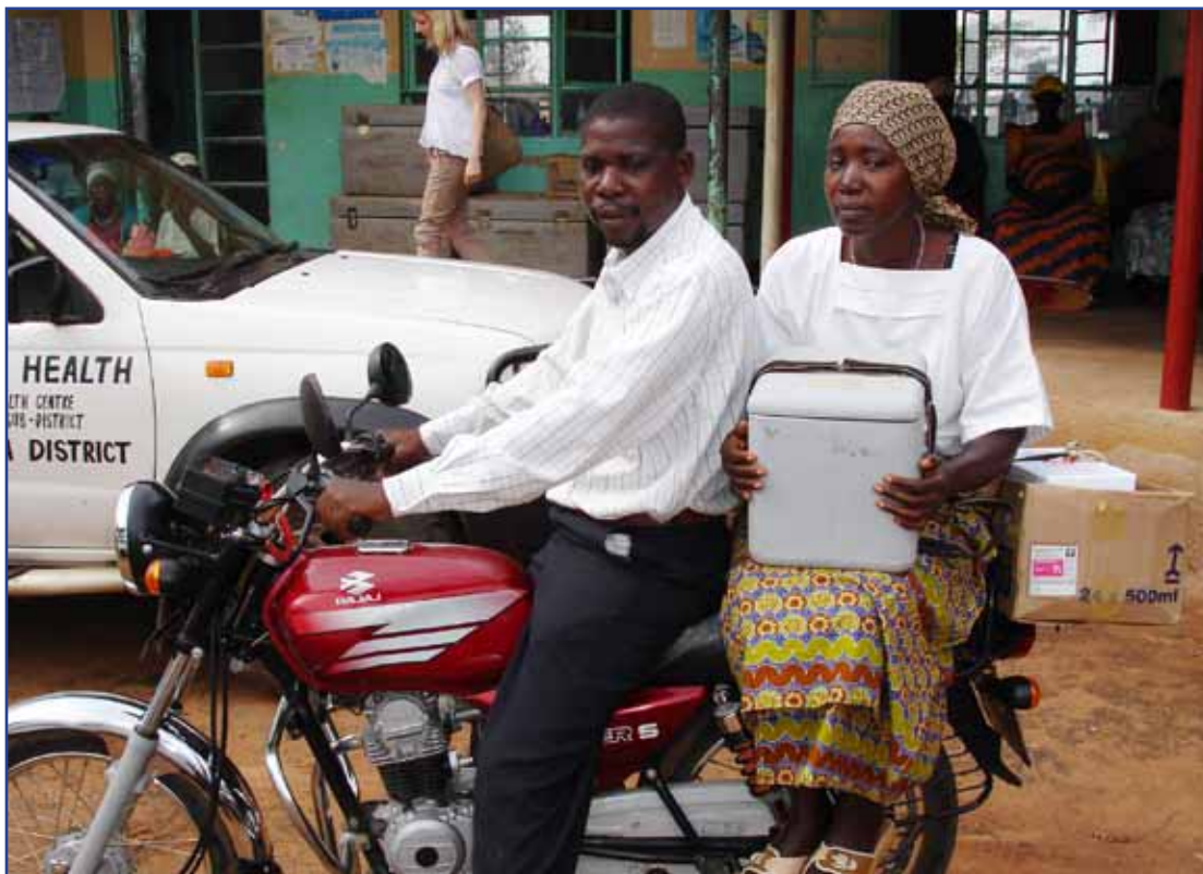
Health workers transport HPV vaccines to a vaccination site.

District officials in Ibanda reported that joint planning increased effectiveness of community mobilization and sensitization prior to vaccination. Involvement by health workers, community leaders, teachers, and parents in the same meetings helped eliminate the possibility of