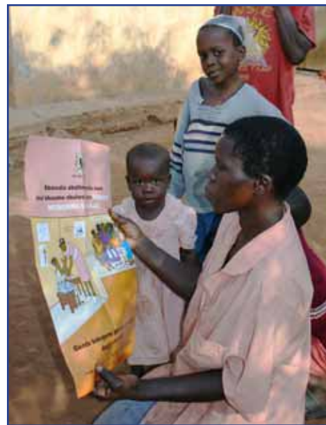
A mother reviews an educational poster about HPV vaccination with her daughters.

This project found that vaccine acceptability among different stakeholders changed over time, from, in some cases, initial reluctance or unwillingness to participate in vaccination to willingness and even enthusiasm. Parents reported that they were initially reluctant to have their daughters vaccinated because they did not know about cervical cancer or understand the purpose of the HPV vaccines. As they learned more, they became less reluctant. Giving parents time to understand and accept the information was therefore a beneficial strategy. Parents of many girls who were fully vaccinated reported that they had received information about HPV vaccination more than one month prior to the vaccination session. In some cases, parents noted that this enabled them to go to schools and seek clarifications if the initial information they heard was unclear. By contrast, lower coverage seemed to occur in places where