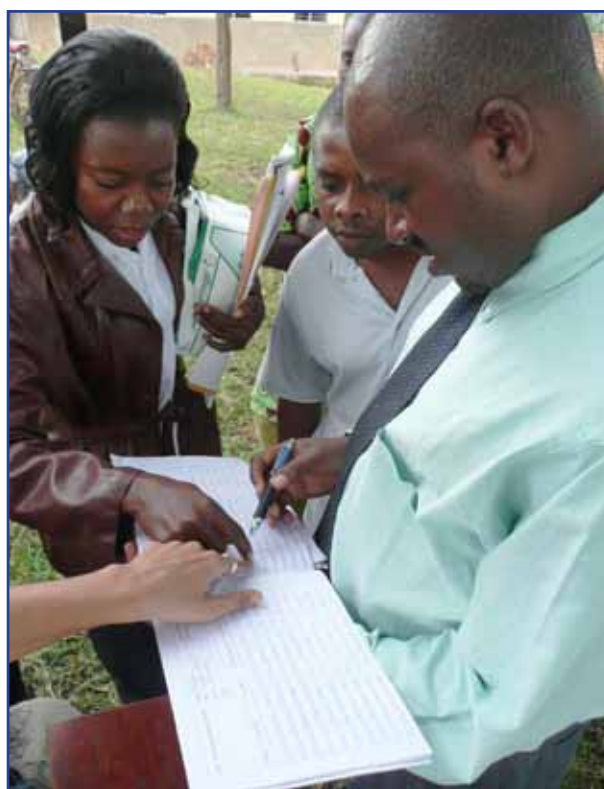
Members of the HPV vaccination team review vaccination logbooks as part of a monitoring visit at Ibanda Kyarukumba Primary School.

Intensive monitoring and evaluation was conducted as part of the HPV vaccination program, guided by a comprehensive monitoring and supportive supervision plan developed during initial program planning and training. Regular and targeted supervision visits by the Ministry of Health and district health teams helped make health providers feel more supported and accountable for performing key tasks. For example, supportive supervision involved helping health workers understand that collection of accurate and complete data would be critical to planning subsequent vaccination activities. In general, health workers stated that in places where monitoring and supportive supervision were more intense and frequent, significant effort was invested in ensuring that all eligible girls were identified, vaccinated, or followed up.