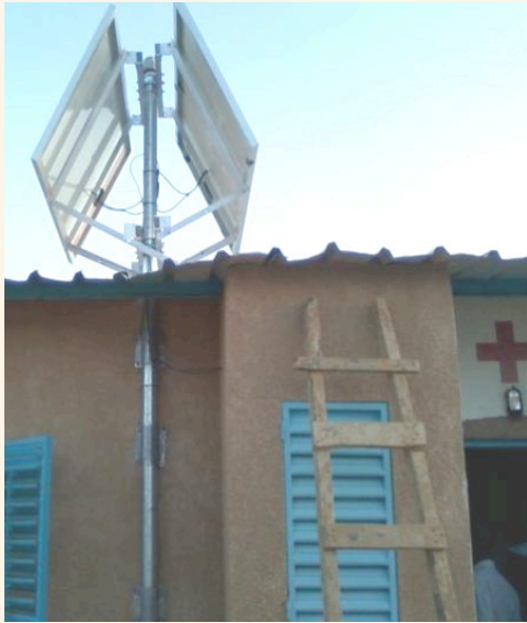
Figure 4. East/West-facing solar generators for the SunDanzer refrigerators in Senegal.

Experience in both countries has shown that solar direct-drive refrigerators are a viable solution for areas lacking consistent electricity. The technology brings important advantages and is a good option for countries to consider at a time when WHO and UNICEF are discouraging the purchase of absorption refrigerators. There are currently several different offerings in the market, and solar manufacturers are eager to continue perfecting their technologies.