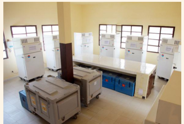
Figure 3. Field testing new technologies allows manufacturers to make improvements to their products.

Users were happy to have a vaccine refrigerator that was independent of the electric grid—when power was cut, they did not have to worry about the vaccine in the Sure Chill®. Challenges with this refrigerator included managing a large amount of condensation resulting from the high humidity, especially in the north of Vietnam, and electrical problems with the compressor controller. The Sure Chill Company has worked diligently to resolve these issues and has also made a number of other improvements to the Sure Chill® as a result of the demonstration in Vietnam, highlighting the importance of carefully monitored field demonstrations for new technologies.