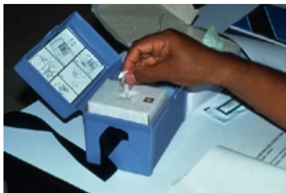
Uniject Outreach Carrier

If not already in place, it is important to plan for an effective disposal system before Uniject devices are introduced. One benefit of the Uniject device is that it contains only about 35 percent of the amount of plastic of a standard disposable syringe. It weighs significantly less than a disposable syringe and single-dose vial. The plastics used in Uniject devices can be incinerated without the generation of toxic fumes, such as those produced by the rubber piston in standard disposable syringes. When incinerated, the basic polymer ingredients of carbon, hydrogen, and oxygen convert to water and carbon dioxide. These materials can usually be safely discharged into the atmosphere.