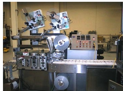
Uniject Packaging Line at PT BioFarma

From start to finish, the process listed above can be expected to take a minimum of two to three years. Fortunately, over 30 pharmaceutical company projects have entered into the process. The targeted drugs include vaccines, injectable contraceptives, uterotonics, and analgesics. Approximately 20 companies have already conducted pilot fills, and 9 have committed to the installation of equipment for filling and packing of Uniject. The first commercial product in the Uniject device became available in 2000. Today the following products are available in the Uniject device: hepatitis B vaccine and tetanus toxoid (TT) from P.T. BioFarma (Indonesia) and hepatitis B vaccine from Lab Pablo Cassara (Argentina).