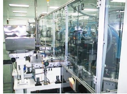
Uniject Production at BD Singapore