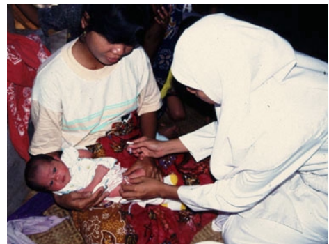
Infant Receiving Hepatitis B Vaccine in the Uniject Device (Indonesia)

As of 2003, with assistance from Global Alliance for Vaccines and Immunization (GAVI) and The Vaccine Fund, Indonesia is providing the birth dose of hepatitis B vaccine in the Uniject device to all infants born in Indonesia. The Indonesian producer, Bio Farma, is working towards WHO prequalification of hepatitis B vaccine in the Uniject device. Once achieved, this product will be available to countries receiving vaccines from GAVI. Vietnam plans a rapid, wide-scale introduction of birth-dose delivery of hepatitis B vaccine in the Uniject device as soon as WHO prequalification of the product is complete.