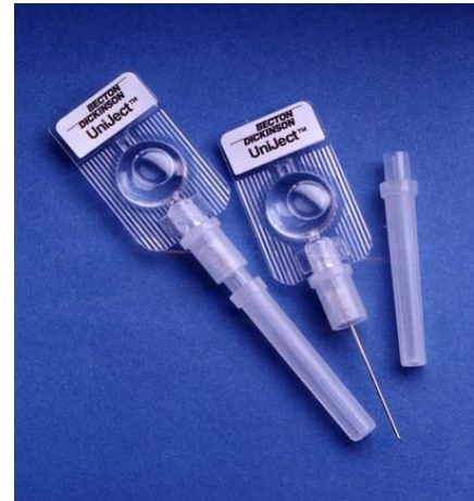
The Uniject Device

A decade ago, prefilled syringes were too costly for use in public-sector health programs, and no prefilled syringe on the market offered an auto-disable feature. With support primarily from the United States Agency for International Development (USAID), under the Technologies for Health (HealthTech) project, and guidance from the World Health Organization (WHO) and a multitude of other collaborators, PATH developed an auto-disable, prefilled syringe known as the Uniject™* device. Today, the Uniject device is licensed to Becton Dickinson (BD), the world's largest manufacturer of injection equipment, for commercial production and distribution. This report provides an update to public-sector agencies on the status of the Uniject device.